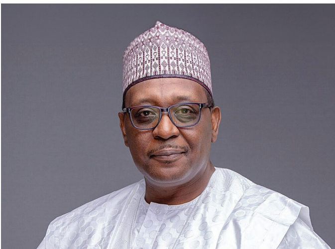
Minister Muhammad Ali Pate Co-chair, REACH Network